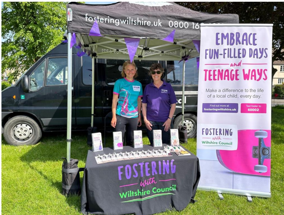
Photos of our information stands during Foster Carer fortnight – 15 to 28 May 2023